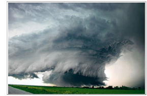
Judgments, A Call to Repentance

So, for its time, the ark would be an engineering monument. It would have been enormous! Most likely, it would have been featured on some Discovery channel back in its day.