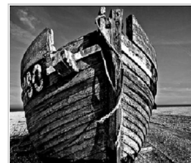
The Mental Agonies of Hell, by Robert Murray M'Cheyne