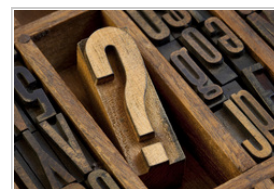
How Shall We Escape If We Neglect So Great a Salvation?