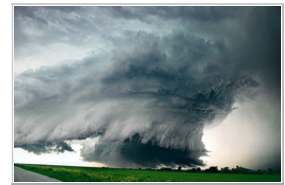
Judgments, A Call to Repentance