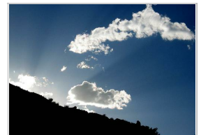
Heaven is a World of Love, by Jonathan Edwards

Audio recordings of history's greatest sermons